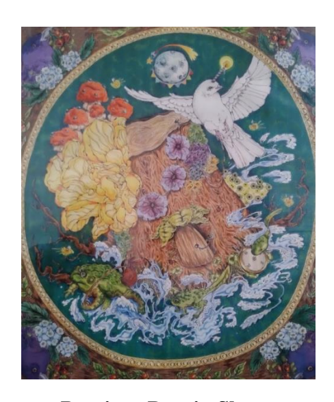
Previous Best in Show: